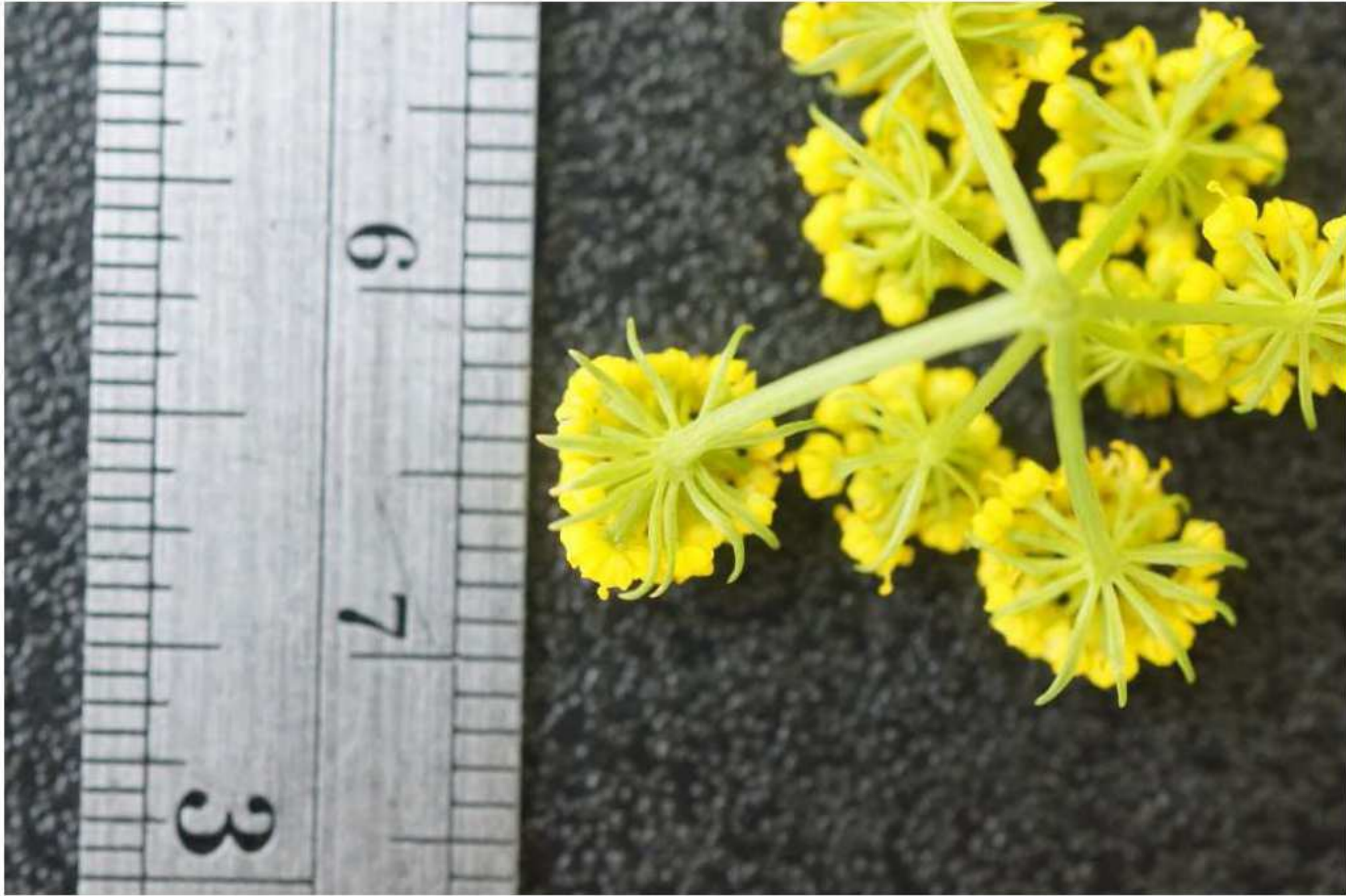
Figure 5. Lomatium knokei inflorescence showing well-developed involucel bracts.